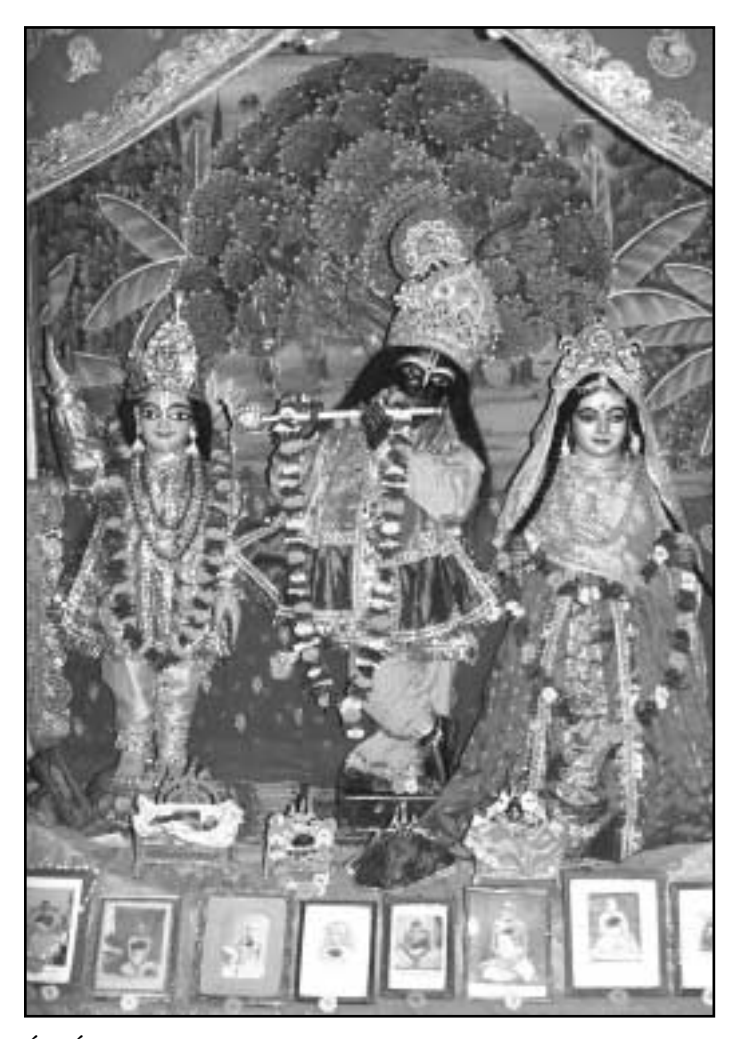
Śrī Śrī Guru-Gaurāṅga-Gāndharvā-Govindasundarjīu Nabadwīp Śrī Chaitanya Sāraswat Maṭh