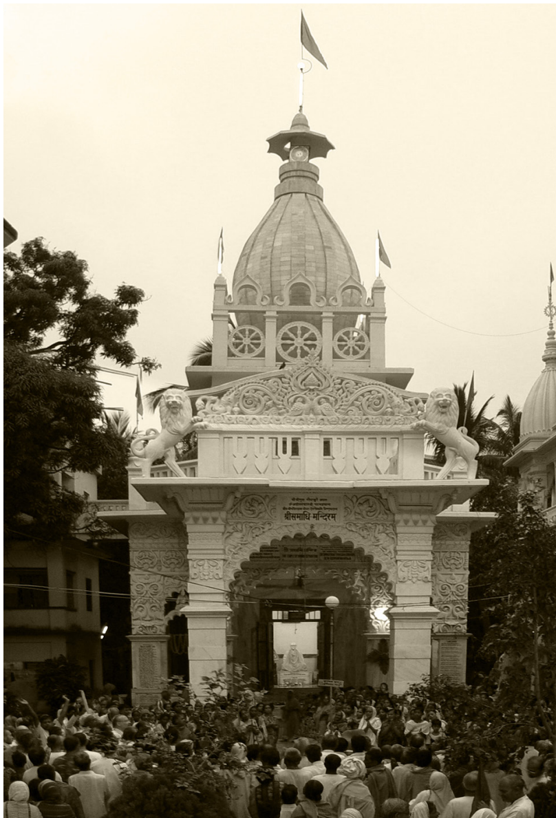
Sri Samadhi Mandir of Srila Bhakti Rakṣak Sridhar Dev-Goswami Maharaj